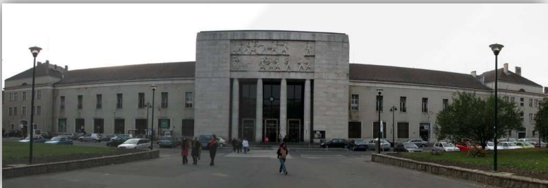
The Railway Station in Győr